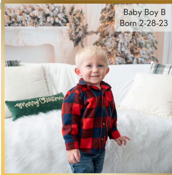
Baby Boy B Born 2-28-23

"The Bible Studies at PLC encouraged me to join and attend a Women's Bible Study at church. The staff is always kind and encouraging and takes time to talk."