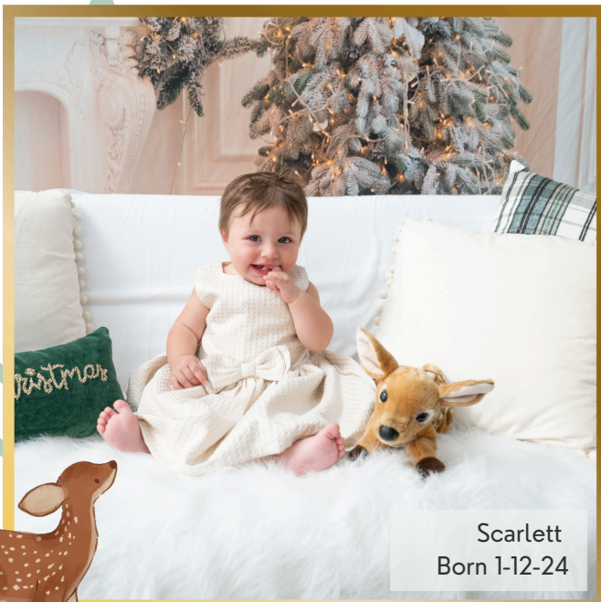
Scarlett Born 1-12-24